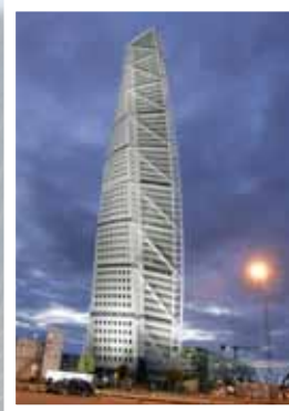
Turning Torso, a 190 m tall building for residents.