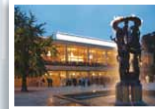
Malmö Opera House