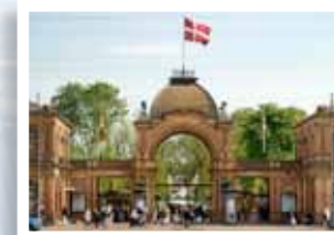
Tivoli Amusement Park in Copenhagen.